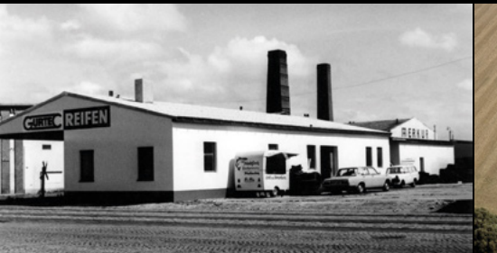
2005 - HM140/150 roller production